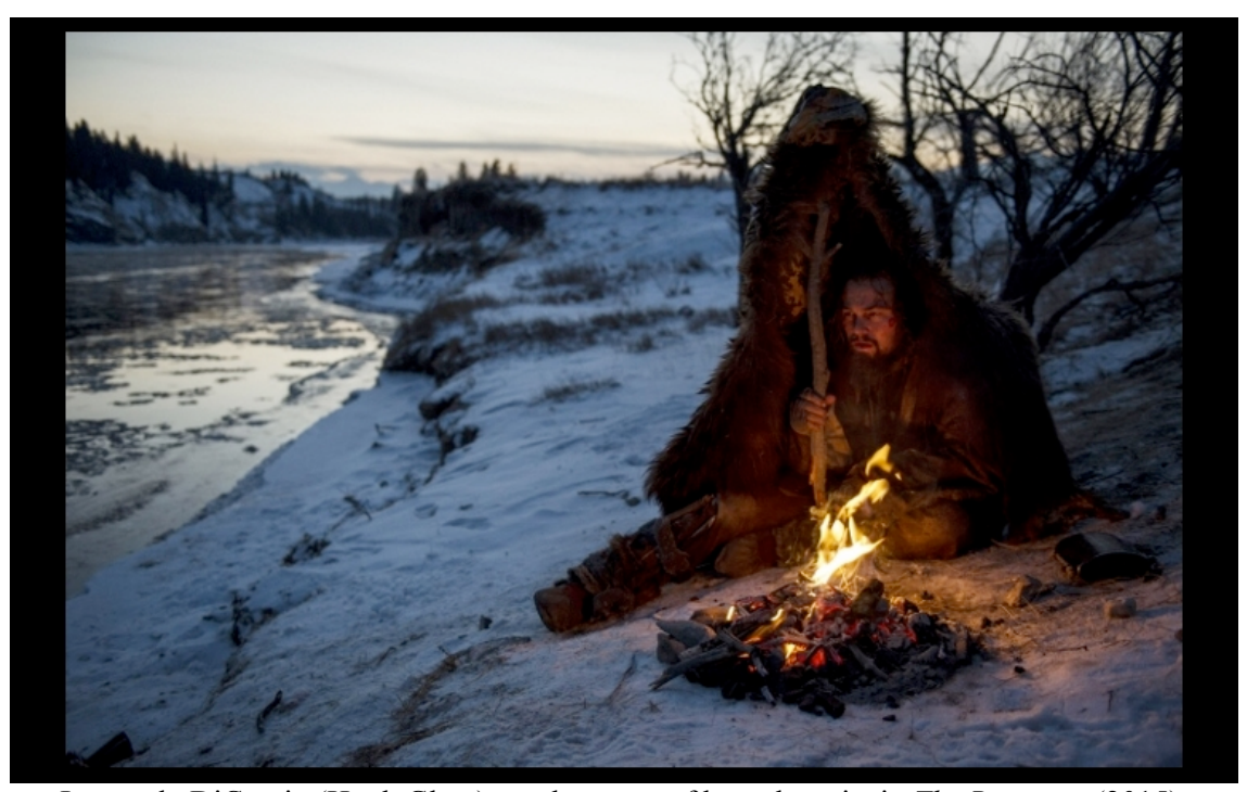
Leonardo DiCaprio (Hugh Glass), on the verge of hypothermia, in The Revenant (2015).

The Revenant offers an excellent reconstruction of everything relating to material culture: costumes, survival equipment, firearms, preparation of pelts, keelboats, small forts, American Indian villages, etc. The production team called on expertise from fur trade historians affiliated with the Museum of the Fur Trade (Nebraska) and the Museum of the Mountain Man (Wyoming). They also worked with linguists specialising in the related Pawnee and Arikara languages spoken by the film's American Indian protagonists. The use of native languages has become a requirement in Hollywood ever since Dances with Wolves in 1990 (despite the fact that specialists find the Pawnee language used in Kevin Costner's film laughable). The last remaining native speakers of Pawnee and Arikara disappeared at the turn of the 2000s, so The Revenant 's producers consulted several linguists, including Douglas R. Parks, <sup>10</sup> an anthropologist at Indiana University who has been studying these two languages for almost fifty years. As the film shows, the Arikaras and Pawnees were far from the most 'typical' Indians of the Plains; unlike the Sioux, for example, they were sedentary, agricultural peoples who lived in large earth lodges. For once in Hollywood, here the Pawnees are not restricted to their role as the villains of the Plains. Ultimately, though, we learn very little about the American Indians, who flit across the screen like shadows.